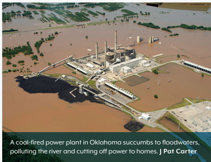
A coal-fired power plant in Oklahoma succumbs to floodwaters, polluting the river and cutting off power to homes.

WHAT'S NEXT: LightHawk photos will be used by American Rivers and Waterkeeper Alliance to influence river management and inspire people to restore natural river systems.